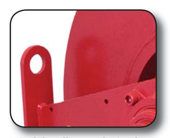
Winch handling made simple with lifting eyes on frame.

Leading the industry with our Move It With Confidence Two-Year Limited Warranty.