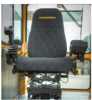
Ergonomic Operator's Seat