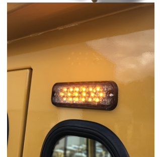
All LED Lighting