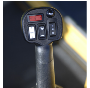
Joystick & Armrest Controls