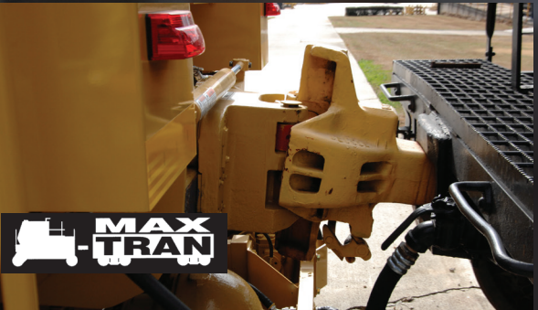
Automatic Weight Transfer System The number of cars moved may vary based on track conditions, load, and other factors.