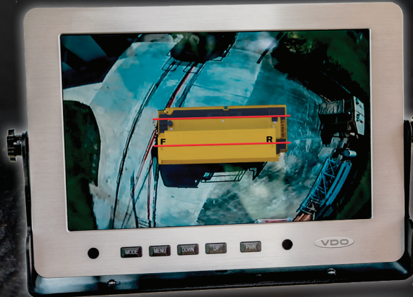
Patent Pending Safe-T-Vue™ 360° Visibility and Railing System Monitor

* Feature is an option **With authorization code provided in newly manufactured Trackmobile purchases.