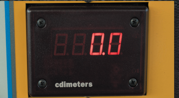
Standard Train Air Charge Indicator